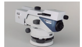
Optical Micrometer OM5 (B20)