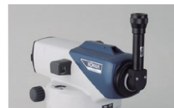
Diagonal Eyepiece DE16 (B20)