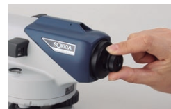
40x Eyepiece EL5 (B20)