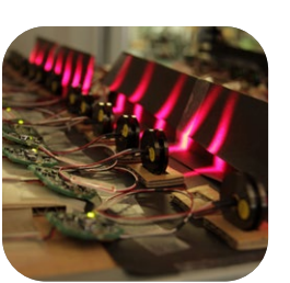
Laser Endurance Test