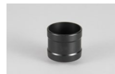
360° Prism protector ATP guard