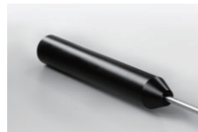
Hand grip SB190