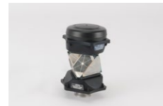
360° Prism ATP2