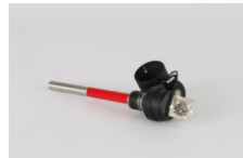
Candy mirror CM-7PPO