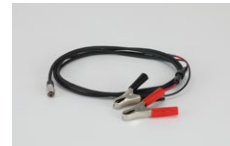
Car battery cable EDC213 (LN-160 Only)