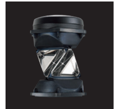
360° prism ATP2