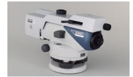
Optical Micrometer OM5 (B20)