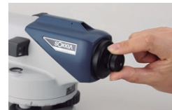
40x Eyepiece EL5 (B20)