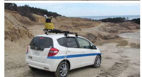
Top: The IP-S3 HD1 on a bicycle trailer. Center: On a motorized wagon. This makes it possible to use the IP-S3 HD1 in places where automobiles and motorcycles cannot enter. Height restrictions under bridges and elsewhere pose no problems.