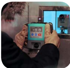
High/Low Temperature Test

SOKKIA believes the product on site must have reliability from the customer. Therefore, the tough environmental test, simulated as tough construction site, is performed for LP610.