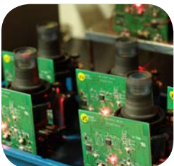
Rotating Head Endurance Test