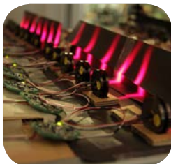
Laser Endurance Test